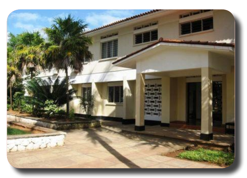
The Old Administration Block