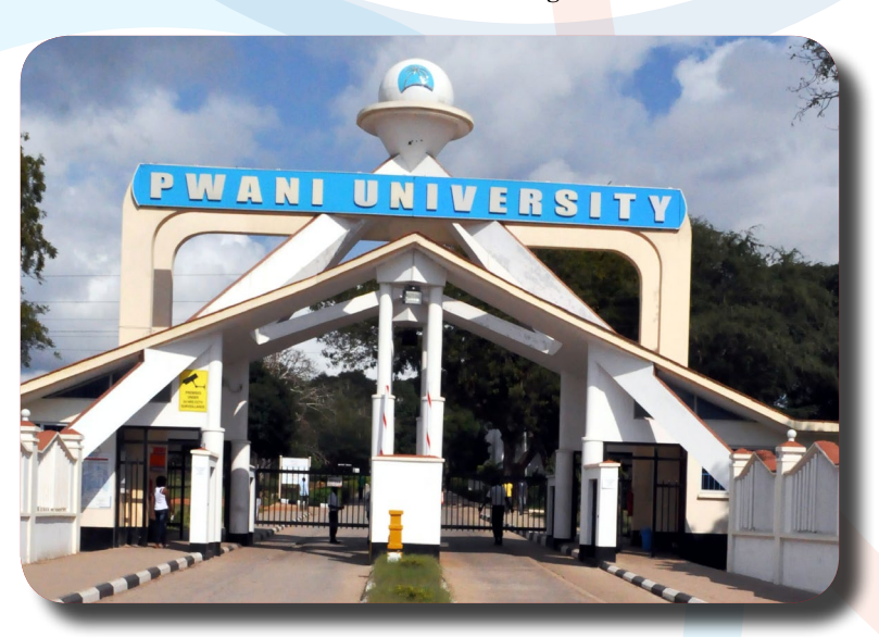
The New Main gate