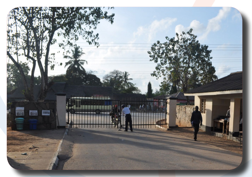
The Old-Look main gate